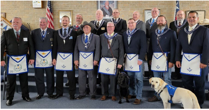
New officers of Kendall Masonic Lodge #897 for 2023-2024