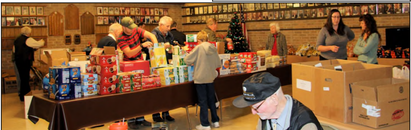
Kendall #897, Boerne Chapter 200 OES, & Texas Hill Country DeMolay Pack Christmas Food Baskets